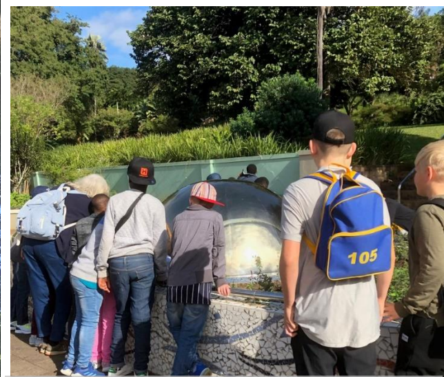
In the Garden of the Senses, strange looking plants, aromatic herbs, and the central brick, metal and water feature, drew a great deal of interest