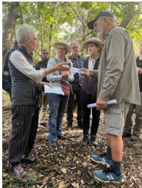
2023 North Park