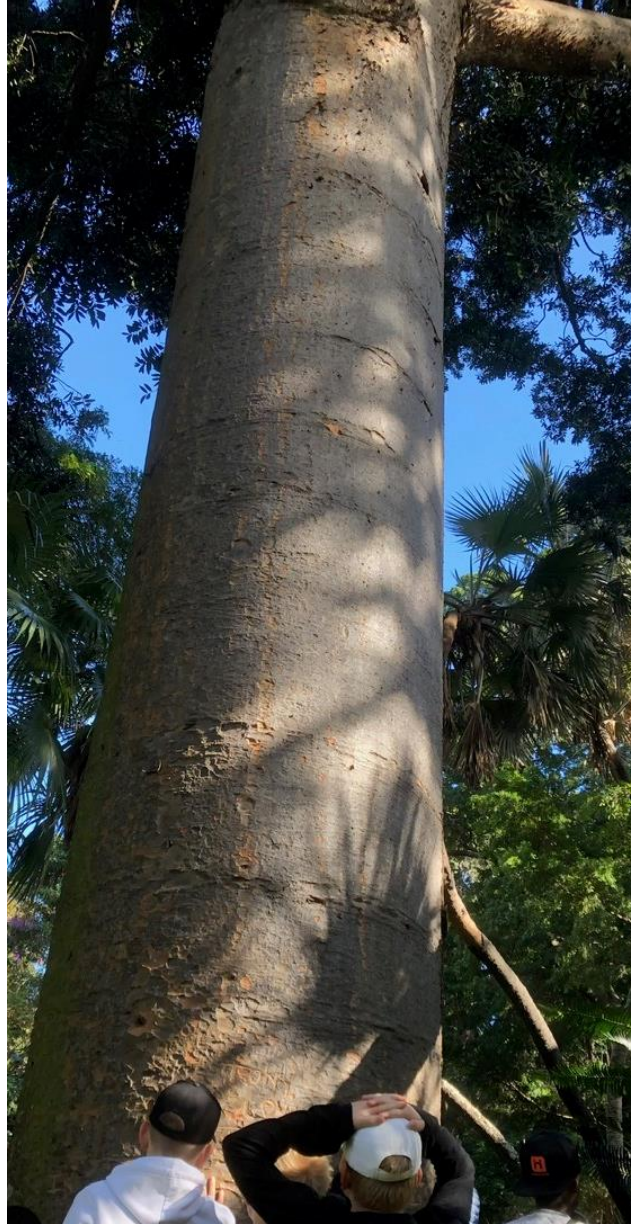
Our group that attended the day at the Durban Botanic Gardens (DBG) was amazed by one of the non-indigenous trees - the Kauri Pine ( Agathis australis ), from New Zealand